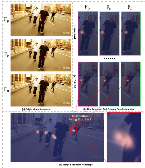
Figure 1. An illustration of our Pose Temporal Merger (PTM) network. (a) : Original video sequence in the datasets, and we aim to detect poses in the current frame F_c . (b) : Each person in the original video sequence is assembled to a cropped clip and a single-person joints detector gives preliminary estimations of keypoint heatmaps (illustrated for right wrist). (c-left) : Merged keypoint heatmaps for the right wrist, generated by our PTM network through encoding the keypoint spatial contexts. The color intensity encodes spatial aggregation. (c-right) : Zoomed-in view of the merged keypoint heatmaps.

is severely hindered in the case of occlusion commonly occurring in multi-person pose estimation and even self-occlusion in the single-person case. [39] proposes a 3DHR-Net (extension of HRNet [33] to include a temporal dimension) for extracting spatial and temporal features across video frames to estimate pose sequences. This model has shown excellent results particularly for adequately long duration single-person sequences. Another line of work considers fine-tuning the primary prediction with high confidence keypoints from the adjacent frames. [31, 28] propose to compute the dense optical flow between every two frames, and leverage the additional flow based representations to align the predictions. This approach is promising when the optical flow can be computed precisely. However in cases involving motion blur or defocus, the poor image qualities lead to imprecise optical flows which translates to performance drops.