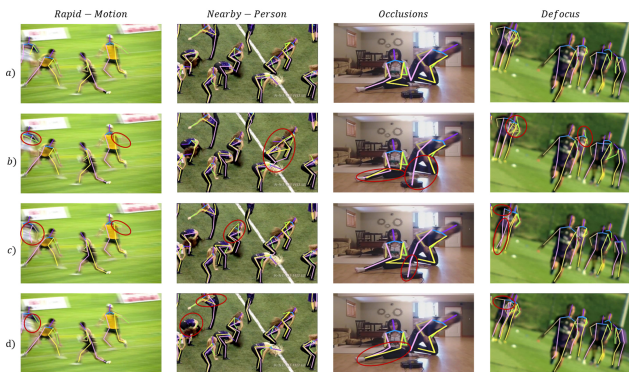
Figure 4. Visualization of the pose predictions of our DCPose model(a), SimpleBaseline(b), HRNet(c), and PoseWarper(d) on the challenging cases from the PoseTrack2017 and PoseTrack2018 datasets. Each column from left to right represents the Rapid-Motion, Nearby-Person, Occlusions, and Video-Defocus scene, respectively. Inaccurate predictions are highlighted with the red solid circles.

dilation rates, from 81.7 \rightarrow 81.9 \rightarrow 82.7 \rightarrow 82.6 \rightarrow 82.8 . This is in line with our intuitions that increasing the depth and scope of the effective receptive fields, i.e. , by varying the range of dilation rates, the Pose Correction Network is able to model local and global contexts more efficiently, leading to more accurate estimations of the joint locations.