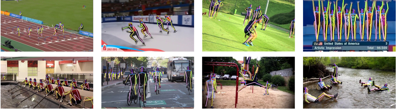
Figure 3. Visual results of our model on the PoseTrack2017 and PoseTrack2018 datasets comprising complex scenes: high-speed movement, occlusion, and multiple persons.

rection Network, we evaluate their contributions towards the overall performance. We also investigate the efficacy of including information from both temporal directions as well as the impact of modifying the temporal distance, i.e. , frame intervals between F_c and F_p, F_n . The results are reported in Table 5.